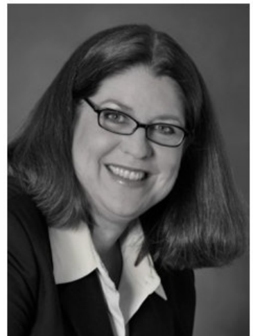
RCNA Member, Milwood Resident