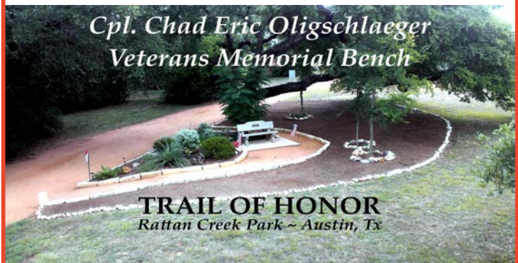
TRAIL OF HONOR Rattan Creek Park ~ Austin, Tx