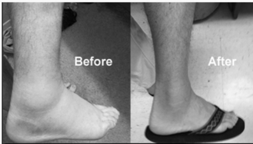
This gentleman had a severe type 3 sprain with considerable damage on his right ankle. This is what St. Jude's Miracle oil® did with one week of applying daily.